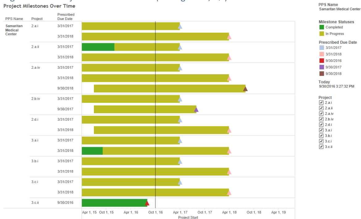
Figure 6: NCI Project Milestone Status (through DY2, Q2) 8

Data Source: NCI DY2, Q2 PPS Quarterly Report