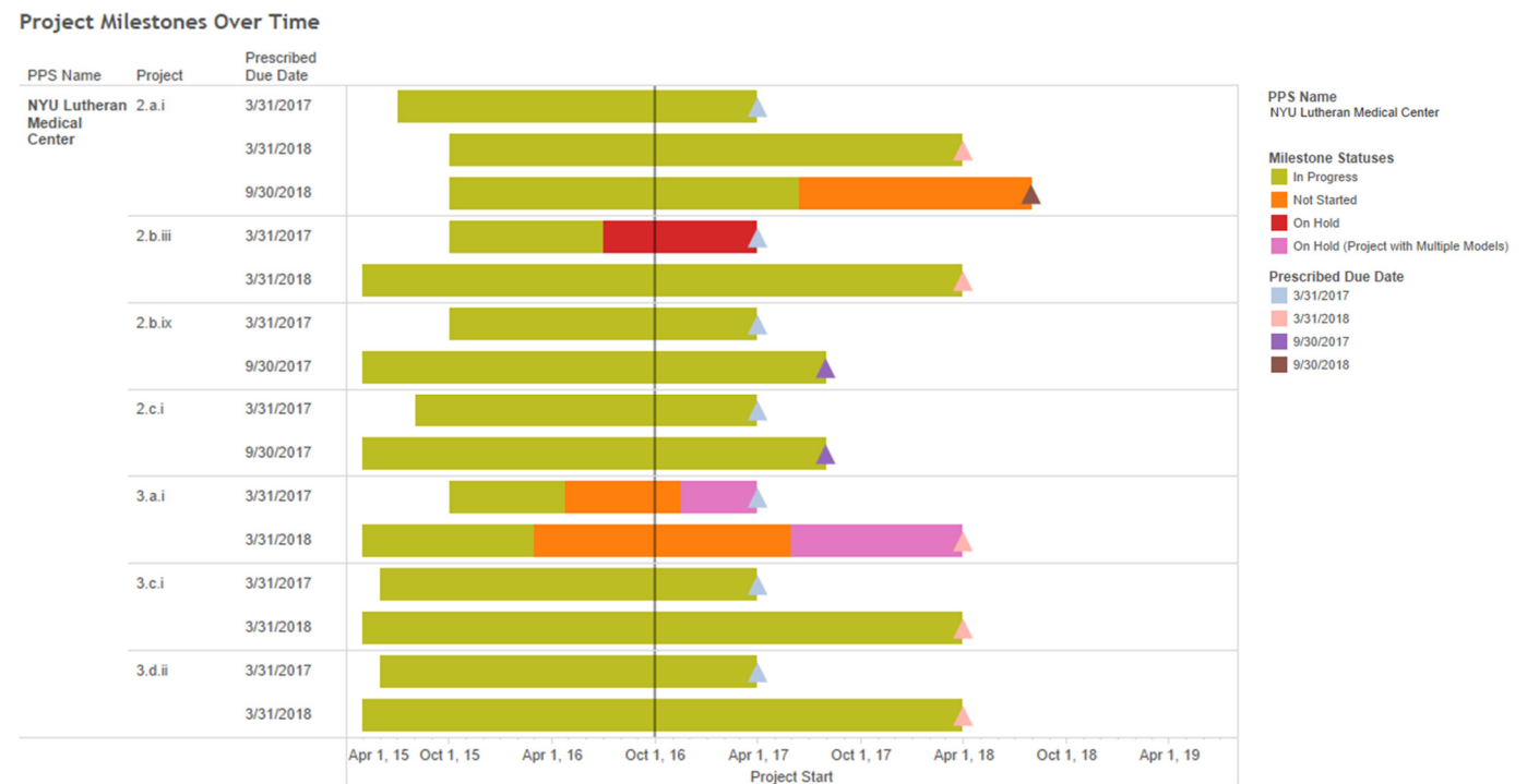
Figure 6: NYU Lutheran Project Milestone Status (through DY2, Q2)8

The first element that the IA evaluated was the current status of the PPS project implementation efforts as indicated through the DY2, Q2 PPS Quarterly Reports. For each of the prescribed milestones associated with each Domain 2 and Domain 3 project, the PPS must indicate a status of its efforts in completing the milestone. The status indicators range from 'Completed' to 'In Progress' to 'On Hold'. Figure 6 below illustrates NYU Lutheran's current status in completing the project milestones within each project. Figure 6 also indicates where the required completion dates are for the milestones.