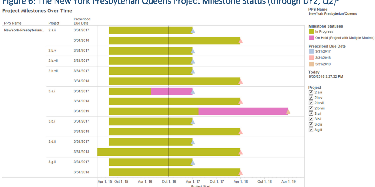
Figure 6: The New York Presbyterian Queens Project Milestone Status (through DY2, Q2)8

The first element that the IA evaluated was the current status of the PPS project implementation efforts as indicated through the DY2, Q2 PPS Quarterly Reports. For each of the prescribed milestones associated with each Domain 2 and Domain 3 project, the PPS must indicate a status of its efforts in completing the milestone. The status indicators range from 'Completed' to 'In Progress' to 'On Hold'. Figure 6 below illustrates NYPQ's current status in completing the project milestones within each project. Figure 6 also indicates where the required completion dates are for the milestones.