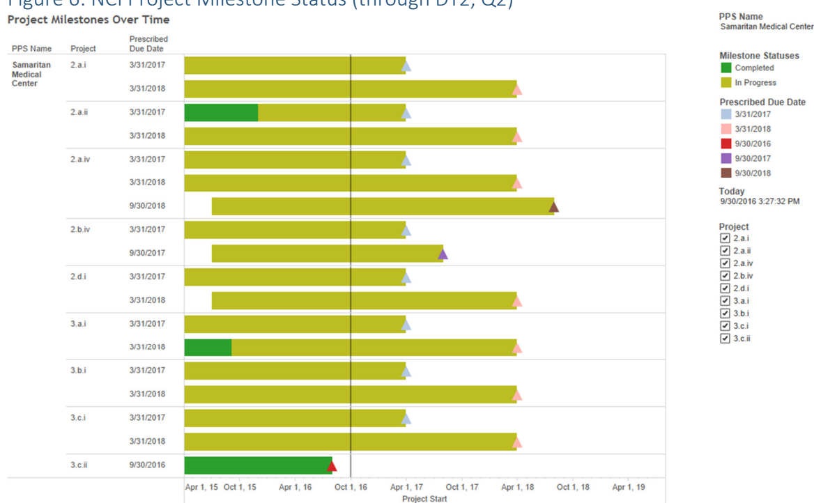
Figure 6: NCI Project Milestone Status (through DY2, Q2)<sup>8</sup>

The first element that the IA evaluated was the current status of the PPS project implementation efforts as indicated through the DY2, Q2 PPS Quarterly Reports. For each of the prescribed milestones associated with each Domain 2 and Domain 3 project, the PPS must indicate a status of its efforts in completing the milestone. The status indicators range from 'Completed' to 'In Progress' to 'On Hold'. Figure 6 below illustrates NCI's current status in completing the project milestones within each project. Figure 6 also indicates where the required completion dates are for the milestones.