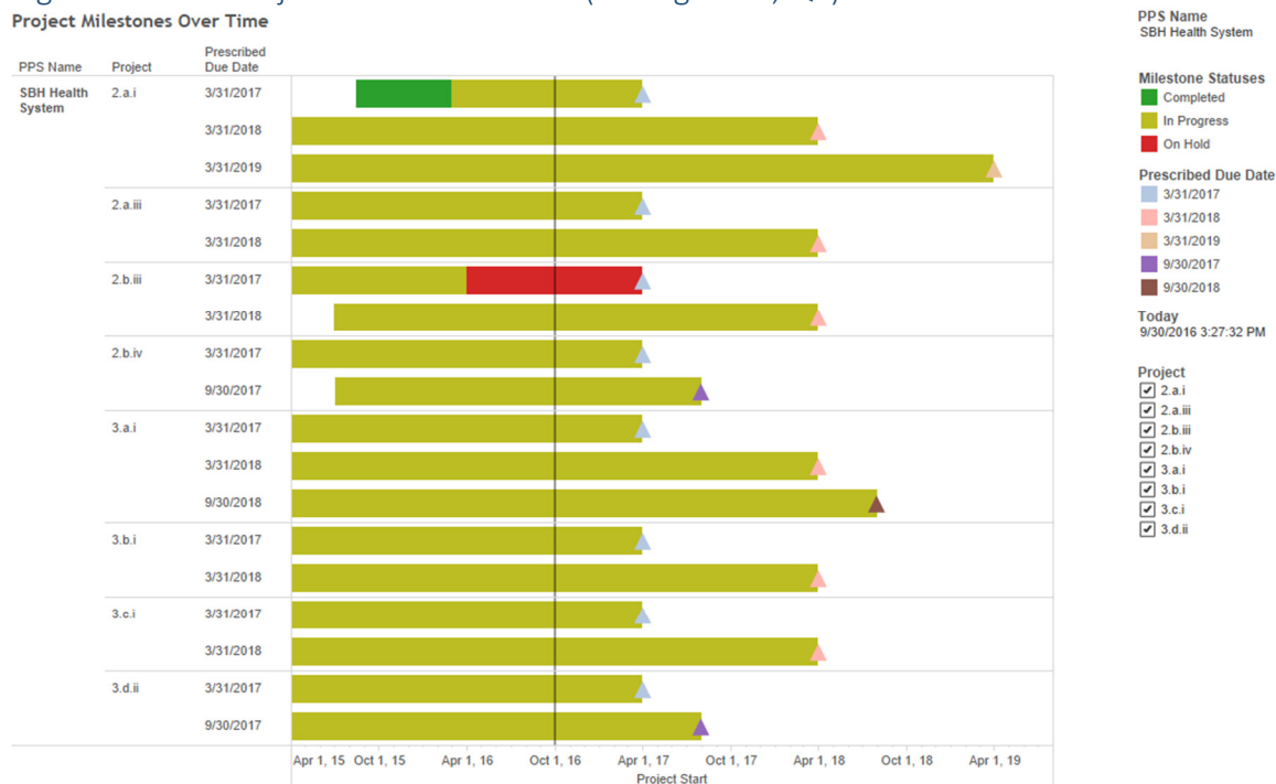
Figure 6: BPHC Project Milestone Status (through DY2, Q2) 8