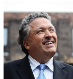
Bruce Mau Co-founder, Massive Change Network and Institute Without Boundaries Chief Design Officer, Freeman Company Author of The Third Teacher .